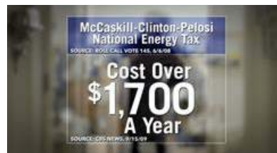
MO-SEN AGAINST CLAIRE MCCASKILL (D)