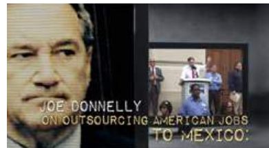
IN-SEN AGAINST JOE DONNELLY (D)